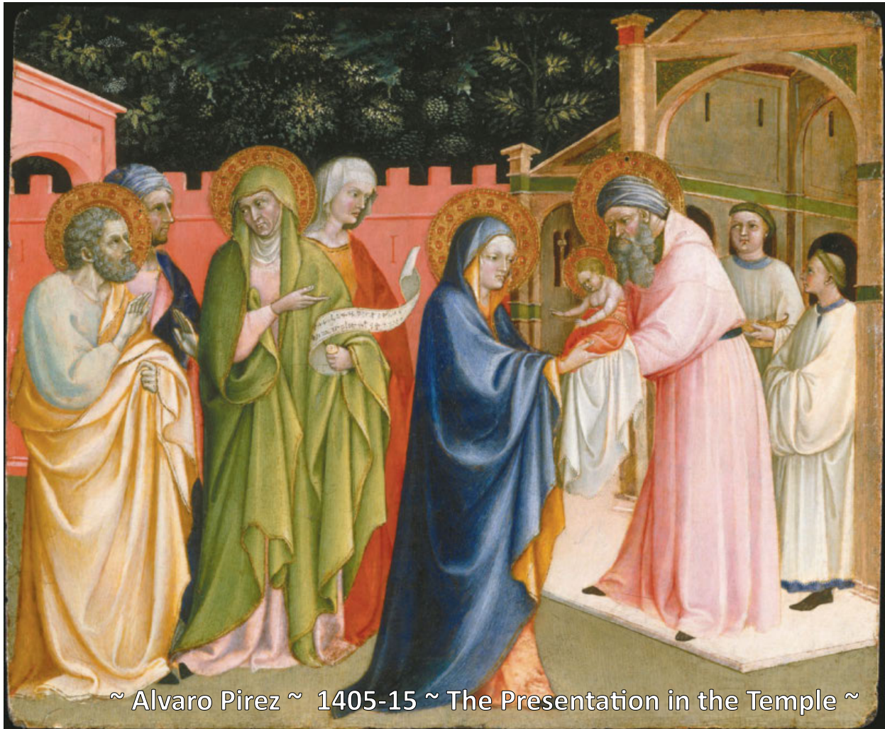
~ Alvaro Pirez ~ 1405-15 ~ The Presentation in the Temple ~