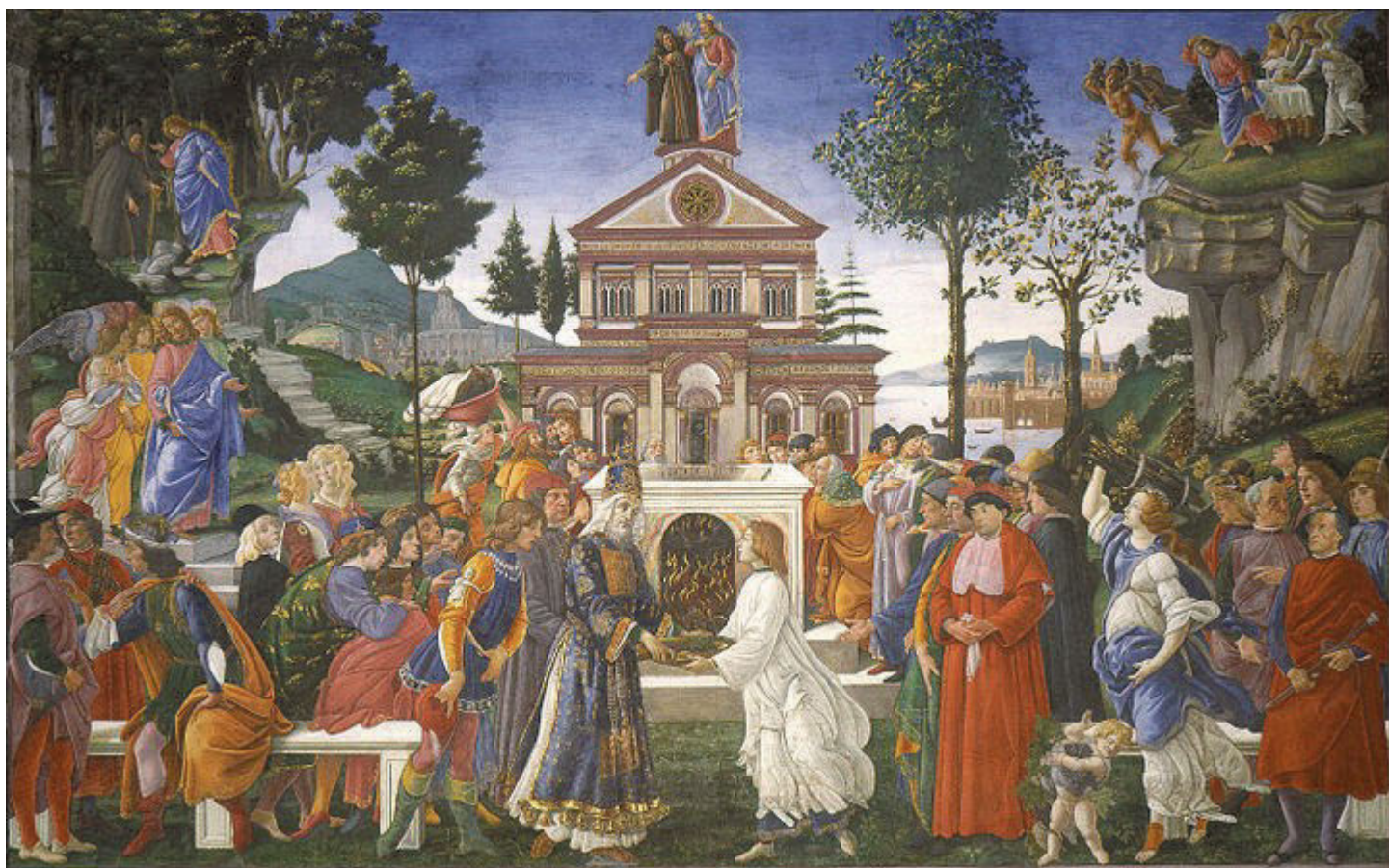
Temptation of Christ by Sandro Botticelli