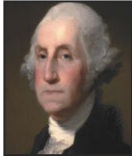
General George Washington America's First President

"While we are zealously performing the duties of good citizens and soldiers, we certainly ought not to be inattentive to the higher duties of religion. To the distinguished character of Patriot, it should be our highest glory to add the more distinguished character of Christian."